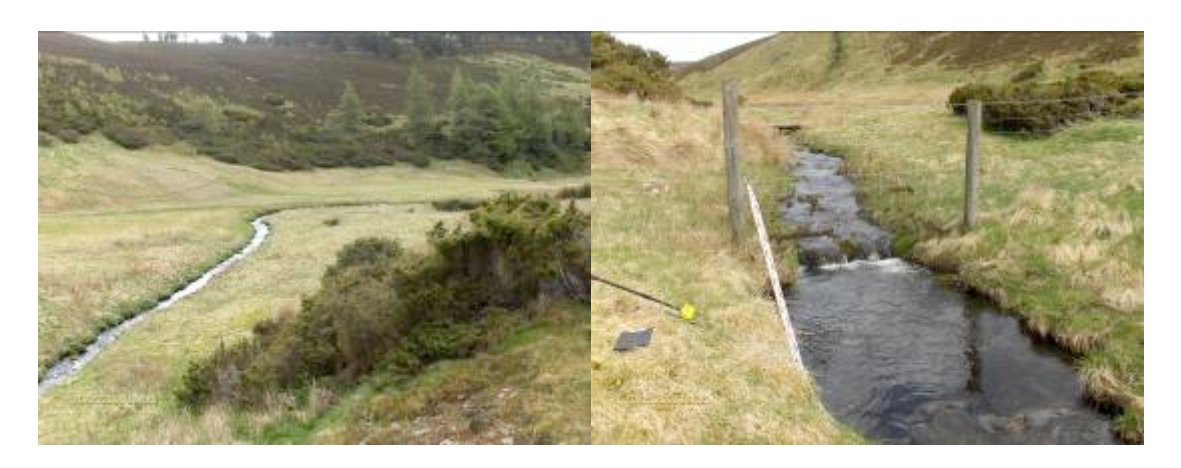
Fig. 2 Burn and valley section below Fig. 3 Burn at site of intake weir intake weir