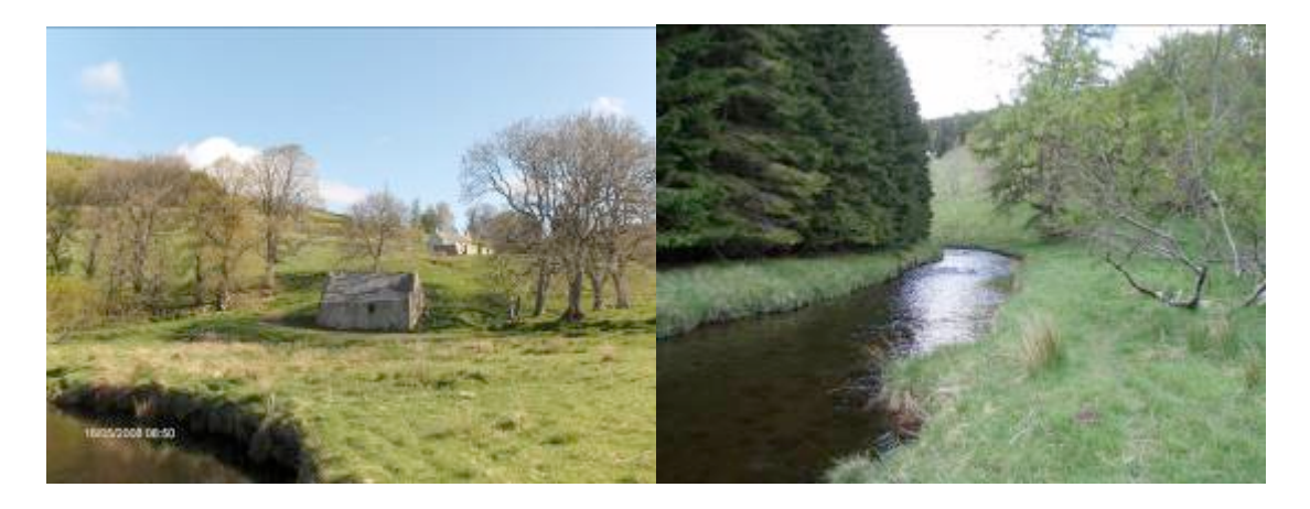
Fig. 4 site of turbine house to right of old mill building, Don and site of out fall in foreground

Fig. 5 Don looking upstream from out fall site